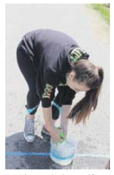
At JM the water buckets used for the relay were, of course, reused to

The JM ECO club is an investment in the future, fueled by the energy of students and teachers at JM where during Earth Week and every week, "every drop counts!"