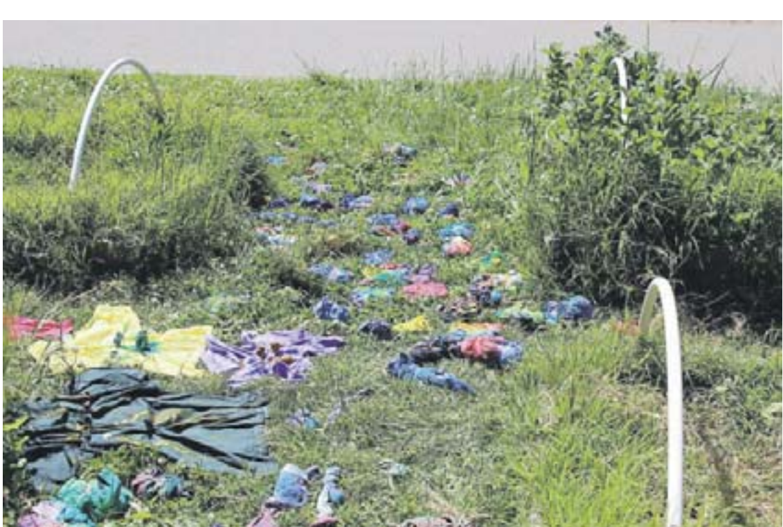
"Old" T-shirts renewed with tie-dye dry in the sun during JM's Earth Week.

campus during Earth Week April 16-22, to spread the message to for our planet.